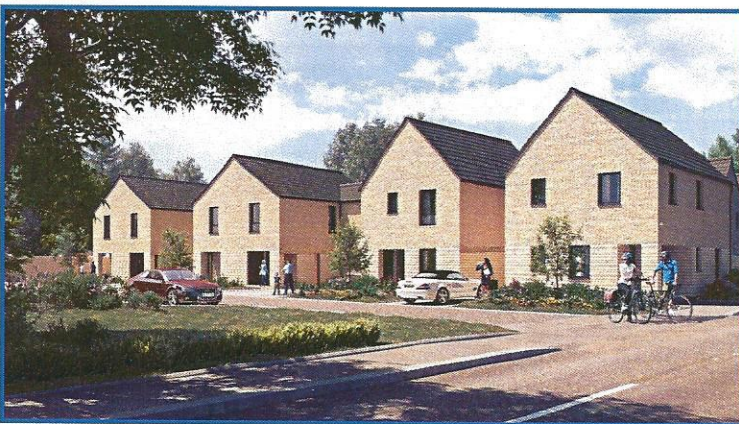
Willowbrook West, St Melons

We recognise that a strong supply chain is key to achieving the construction programme for this scale of project. It is our aim to work ‘closer to fewer’ subcontractors which we believe will lead to greater efficiency and quality and allow you to manage your resources more effectively.